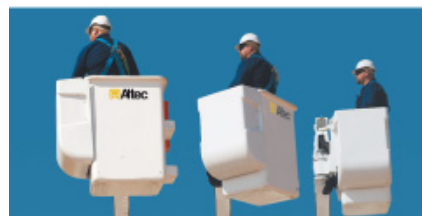
180 degree platform rotator