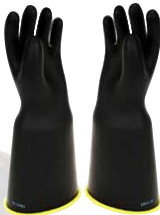
Insulated Electrical Gloves Straight Cuff Class 2 33kV