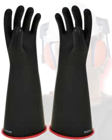
Insulated Electrical Gloves Straight Cuff Class 0 1000V