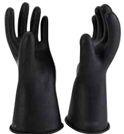
Insulated Electrical Gloves Straight Cuff 16 inch long

The safe method of performing live line work on circuits up to and including 33,000 volts is when the live line worker is fully insulated from earth and phases using approved insulating gloves and sleeves.