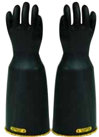
Bell Cuff 18 inch Long Electrical Gloves